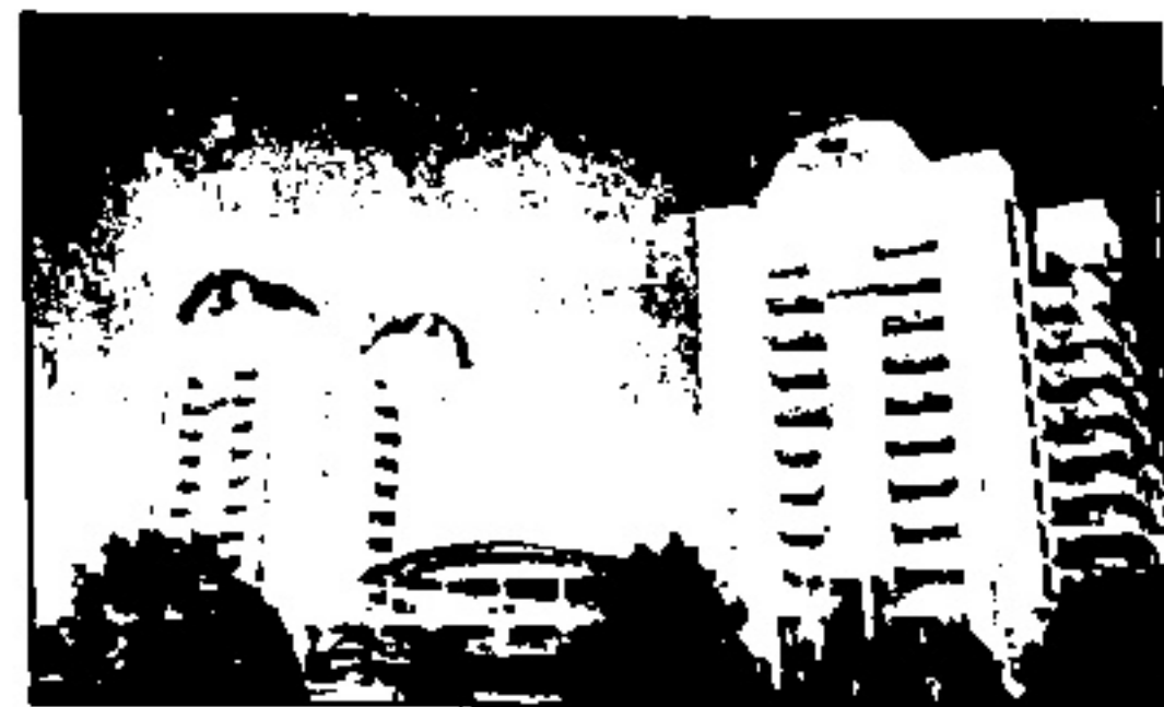
Prestige Park Towers rendering.